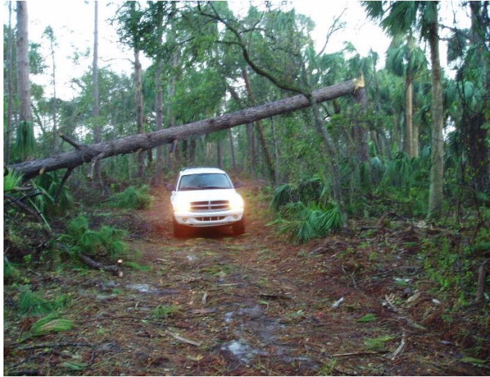
Major tree damage in Vero after 2004 hurricanes.

In December 1999 after several close storms, hurricane shutters were purchased and installed on the church. Little did we know how important that purchase would become. September 5, 2004 Hurricane Frances made a direct hit on the Treasure Coast with 105 mph winds. The church building had several roof leaks which required some shingles to be replaced and the ceilings cleaned. September 26, 2004 Hurricane Jeanne followed the same path with 120 mph winds. Our insurance adjuster recommended replacing the steeple. Several roof leaks occurred which required more repairs and interior cleaning. The Lord spared us the worst!!