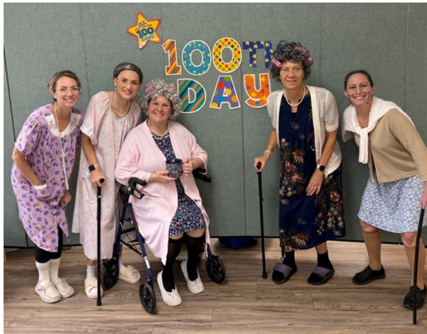
Our teachers celebrating the 100th Day of Preschool on January 22nd !

SCHEDULE CHANGE: Please mark your calendars! The preschoolers will NOT be singing in church on March 22 as originally planned. Instead, they will sing on Sunday, April 26 th for a special service celebrating Gracie's 20 th Anniversary! More information regarding this event will be coming soon!